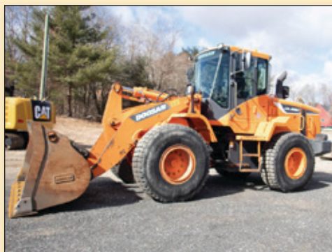
2015 DOOSAN DL250-5 WHEEL LOADER