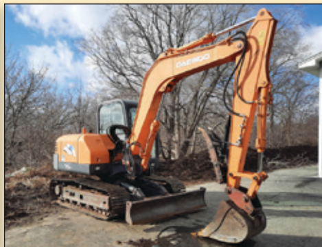
2005 DAEWOO SL75-V EXCAVATOR