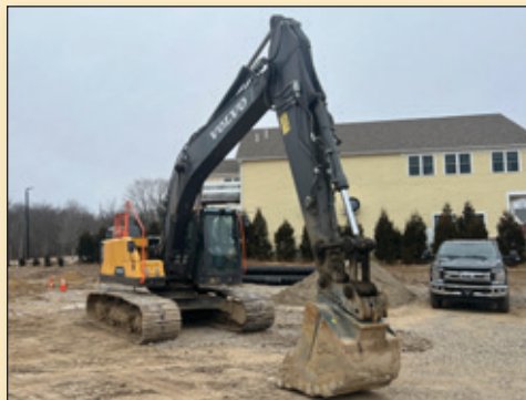
2018 VOLVO EC220EL EXCAVATOR