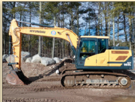
2019 HYUNDAI HX160L EXCAVATOR