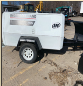
1994 IR P185 AIR COMPRESSOR