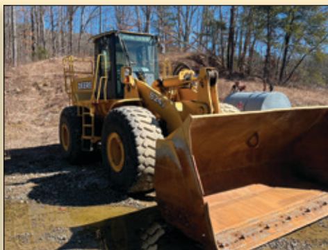
2003 DEERE 824J WHEEL LOADER