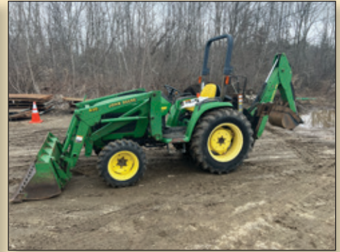
2002 JOHN DEERE 4400 AG/UTILITY TRACTOR