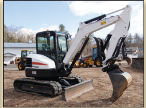
(2) 2021 BOBCAT E45 ZTS CRAWLER EXCAVATOR