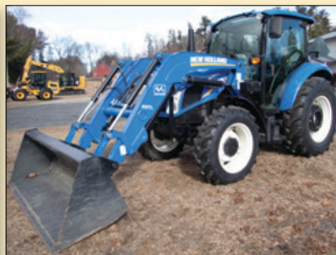
2017 NEW HOLLAND T4.75 AG TRACTOR