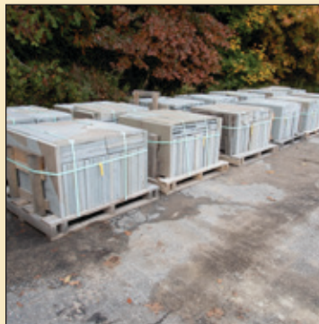
BLUE STONE PAVERS