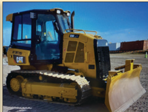
2020 CAT D3K2 CRAWLER DOZER