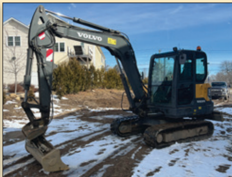
2017 VOLVO EC60E EXCAVATOR