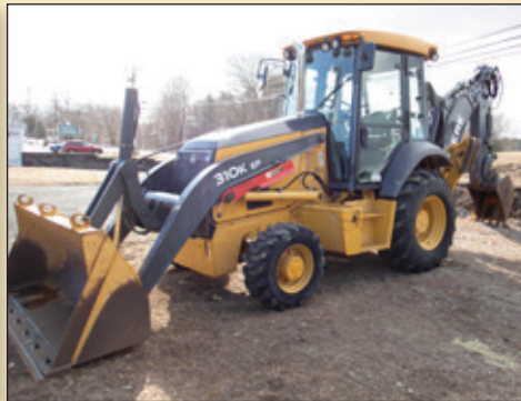
(2) 2014 DEERE 310K LOADER BACKHOE