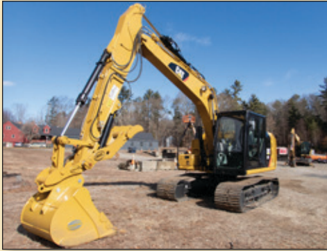
2017 CATERPILLAR 313F CRAWLER EXCAVATOR