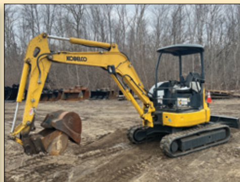
2016 KOBELCO SK35SR-8E EXCAVATOR