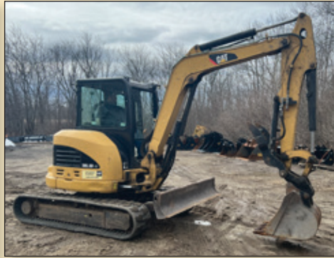
2011 CAT 305.5 DCR EXCAVATOR