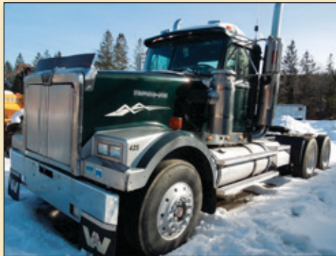
1996 WESTERN STAR T/A TRUCK TRACTOR