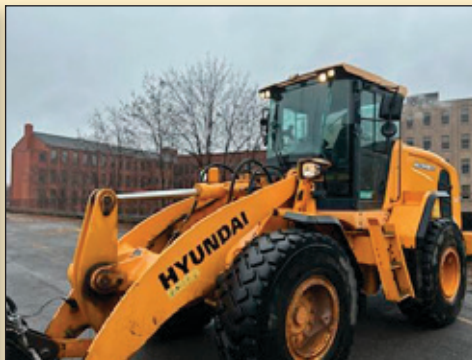
2019 HYUNDAI HL940XT WHEEL LOADER