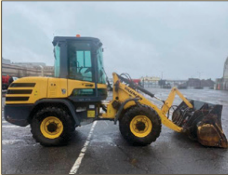
2019 YANMAR V8 WHEEL LOADER