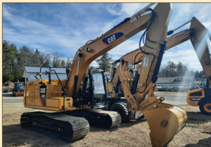
LATE MODEL CAT TRACK AND MOBILE EXCAVATORS