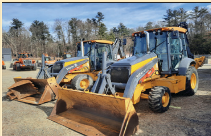
LATER MODEL DEERE LOADER BACKHOES