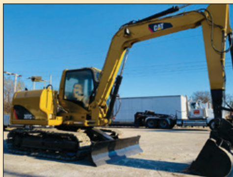
2002 CAT 307C EXCAVATOR