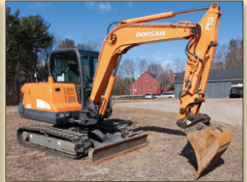
2010 DOOSAN DX55 CRAWLER EXCAVATOR