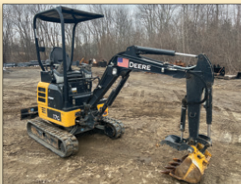
2016 DEERE 17G MINI EXCAVATOR