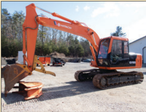
1999 HITACHI EX-120-2 CRAWLER EXCAVATOR