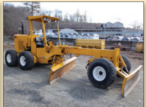
MAULDIN 688D MOTOR GRADER