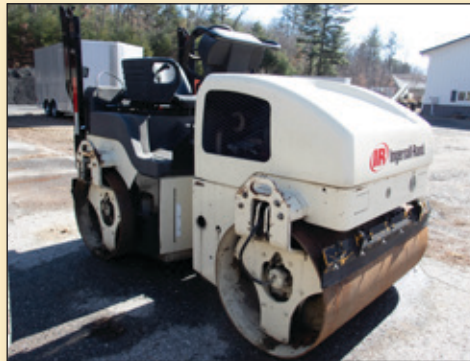
2008 VOLVO 38HF DOUBLE DRUM VIBRATORY ROLLER