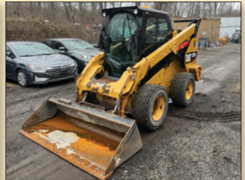
2016 CAT 272D 2 SKID STEER LOADER