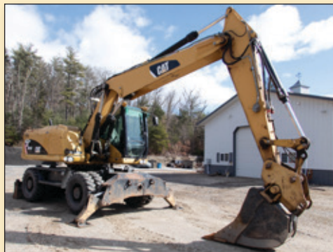
2015 CAT M315D MOBILE EXCAVATOR