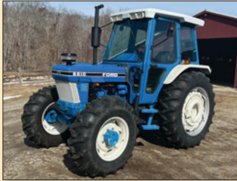
FORD 6610 II AG TRACTOR