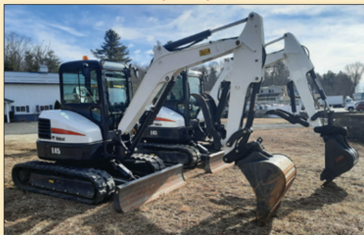
UP TO 2021 MODEL YEAR EXCAVATORS

PREVIEW DATE & TIMES: Onsite Preview Beginning on Friday, March 24, 2023, From 8am-4pm, Saturday, March 25th 8am-4pm, No onsite preview on Sunday. Monday-Thursday March 27th-30th 8am-4pm. Beginning on Auction Day At 7am. Prior Inspections by Appointment Only.