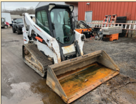
2015 BOBCAT T650 TRACK SKID STEER LOADER