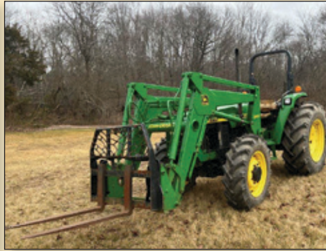
JOHN DEERE 5510 AG TRACTOR