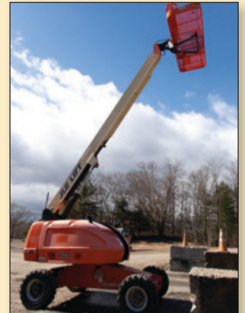
2013 JLG 400S TELESCOPIC BOOM LIFT