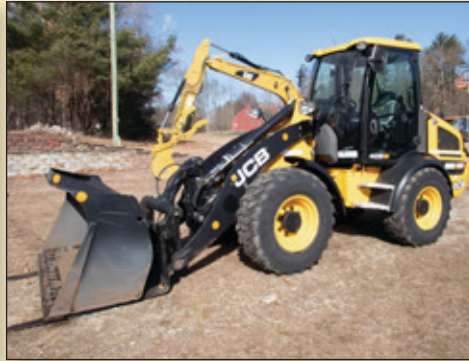
2015 JCB 409 WHEEL LOADER