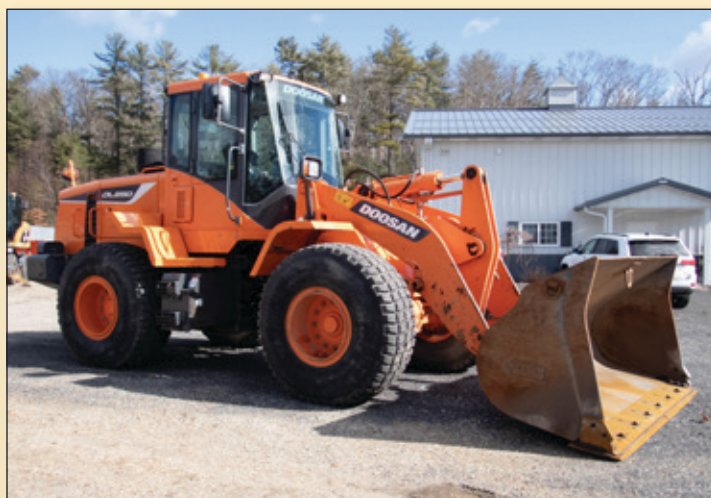
LATER MODEL WHEEL LOADERS